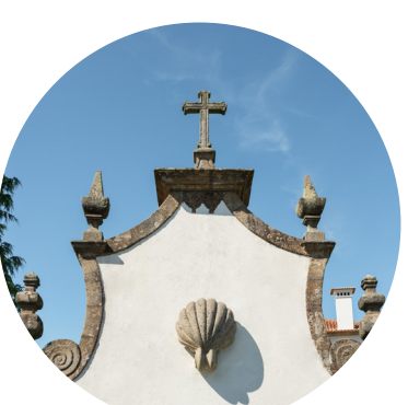
A visit to Quinta dos Cónegos begins from the outside. The house is developed in a large extent, in which several volumes of construction unite. Baroque influence can be appreciated in the various arcades and in the design of the stairway assembly. Surrounding the house is a large green area with various water features.